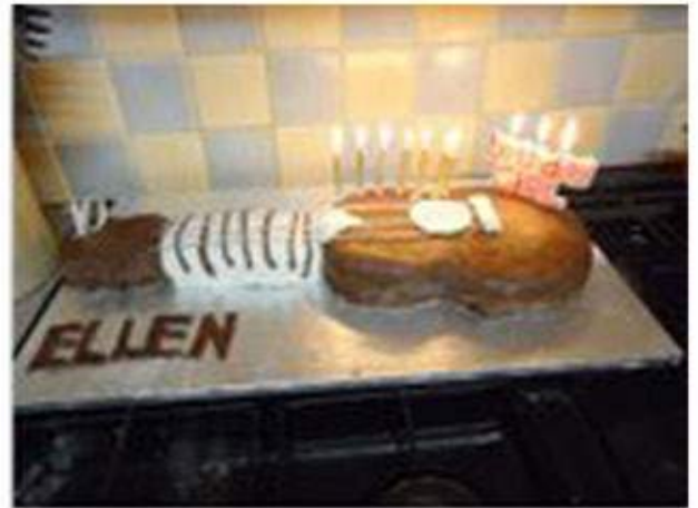
A reminder of last years Ukulele cake